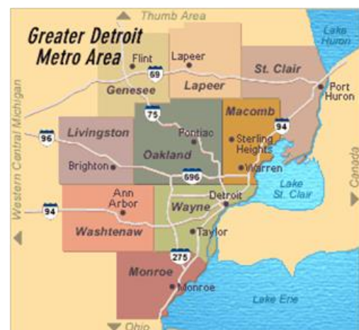
Map showing the 9-county greater Detroit area This is the nine country Detroit Combined Statistical Area,