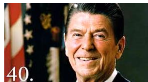
President Ronald Reaan