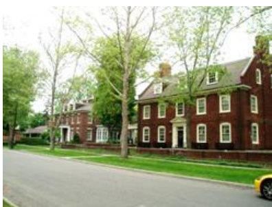
Indian Village Neighborhood

There is an opposing view—one that stresses that Detroit is now the epitome of a polarized city. Some tell the story of today’s Detroit as a “Tale of Two Cities.” Highly skilled and well-compensated scientists, medical specialists, attorneys and financial experts are coming to take the rewarding jobs available in Detroit’s downtown. Many of them may live in the city’s growing upscale neighborhoods. But this may not benefit the residents of the rest of the city who have suffered for decades with poor city services, ineffective schools, deficient police protection and an absence of public transportation. There are many neighborhoods in Detroit that appear untouched by the prosperity of the 7.2 square miles of booming growth.