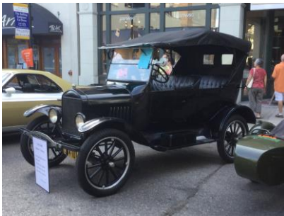
MODEL T FORD, 1924

PICTURE TAKEN AT 2016 ROLLING SCULPTURE CAR SHOW IN ANN ARBOR.