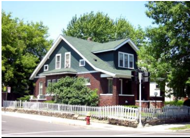
HOME OF DR. OSSIAN SWEET

TOPIC: THE DECLINE OF DETROIT AFTER WORLD WAR II: A STORY OF WHITE VS BLACK; LABOR VS MANAGEMENT AND CITY VS SUBURBAN CONFLICT