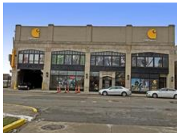
THE GREEN GARAGE 4444 2ND AVE

Private developers and non-profits are using their own resources and a variety of tax abatements to rehabilitate old buildings and construct new ones. Private foundations are investing in the city's educational and social service systems. The state of Michigan and the federal government are providing modest funds to renovate Detroit.