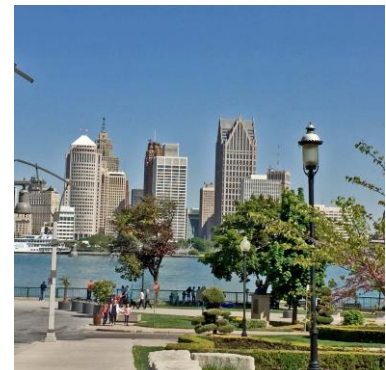
DETROIT SKYLINE AS SEEN FROM WINDSOR