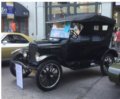
MODEL T FORD, 1924

STUDENTS WITH DISABILITIES If you believe you need an accommodation for a disability, please let me know at your earliest convenience. Some aspects of this course may be modified to facilitate your participation and progress. As soon as you make us aware of your needs, I can work with the Office of Services for Students with Disabilities to help us determine appropriate accommodations. I will treat any information you provide as private and confidential.