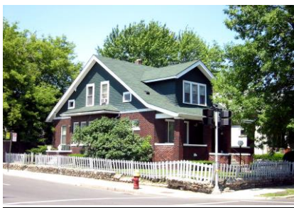
HOME OF OSSIAN SWEET