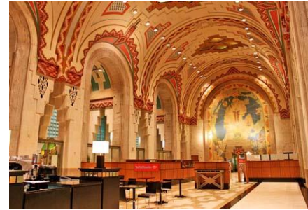
GUARDIAN BUILDING BANK LOBBY