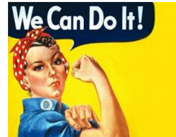
ROSIE THE RIVETER