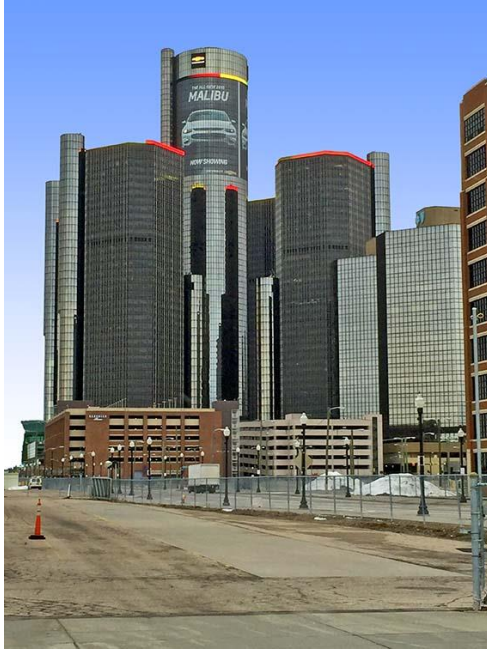
DETROIT RENAISSANCE CENTER PICTURE TAKEN JANUARY 16, 2016