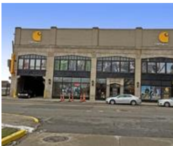
THE GREEN GARAGE 4444 2ND AVE

Young entrepreneurs are creating an array of new businesses in Detroit's Tech-town, at the Green Garage, The Pony Ride and other locations, such as the Russell Industrial Complex. Detroit's elected leaders, much more so than in the past, may now be willing to consider the substantial changes that