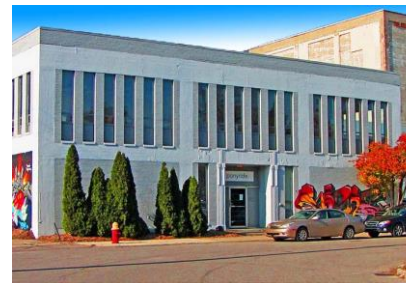
THE PONY RIDE BUILDING 1401 VERMONT AT PORTER IN THE CORK-TOWN NEIGHBORHOOD OF DETROIT

Young entrepreneurs are creating an array of new businesses in Detroit's Tech-town, at the Green Garage, The Pony Ride and other locations, such as the Russell Industrial Complex. Detroit's elected leaders, much more so than in the past, may now be willing to consider the substantial changes that