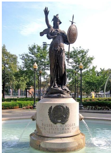
RUSSELL ALGER MEMORIAL FOUNTAIN GRAND CIRCUS PARK

If you believe you need an accommodation for a disability, please let me know at your earliest convenience. Some aspects of this course may be modified to facilitate your participation and progress. As soon as you make us aware of your needs, I can work with the Office of Services for Students with Disabilities to help us determine appropriate accommodations. I will treat any information you provide as private and confidential.