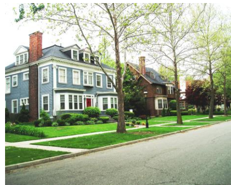
INDIAN VILLAGE NEIGHBORHOOD

Despite the loss of population, jobs and commercial activity, Detroit, remains the heart of the nation's thirteen largest metropolises. It is the 18 th largest city in the country. Those who spend time in Detroit will learn that there are more than a dozen attractive neighborhoods that either never fell in-