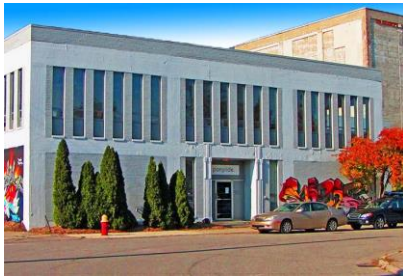
THE PONY RIDE BUILDING 1401 VERMONT AT PORTER IN THE CORKTOWN NEIGHBORHOOD OF DETROIT

Private developers and non-profits are using their own resources and a variety of tax abatements to rehabilitate old buildings and construct new ones. Private foundations are investing in the city's educational and social service systems.