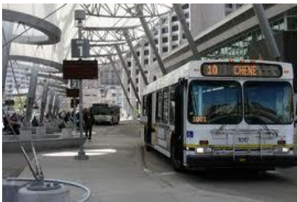
ROSA PARKS TRANSIT CENTER