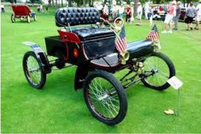
CURVED DASH OLDSMOBILE

Public Policy 626.001 — Autumn Term, 2014 —